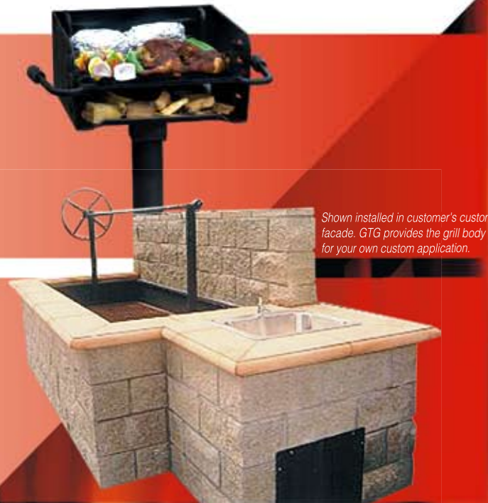
Shown installed in customer's custom facade. GTG provides the grill body for your own custom application.